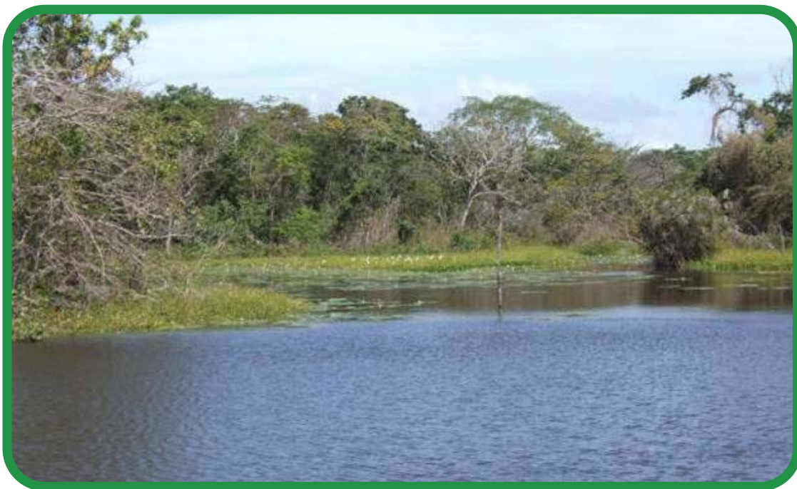
Lake to the East of the property