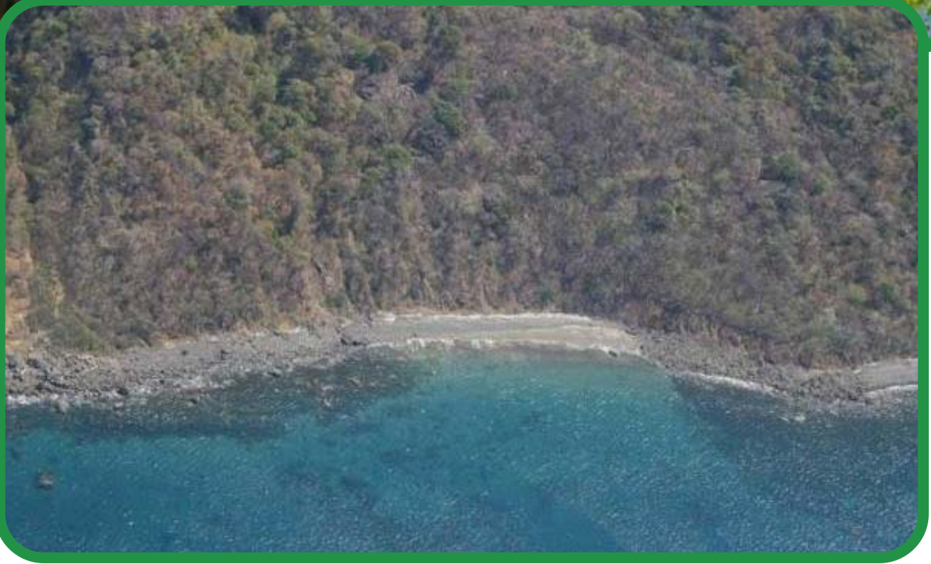
Private sandy beach